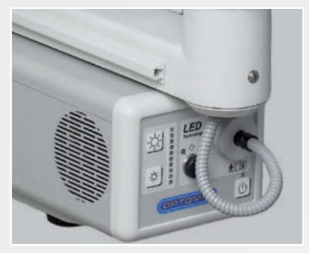
REMOVABLE COLD LIGHT SOURCE