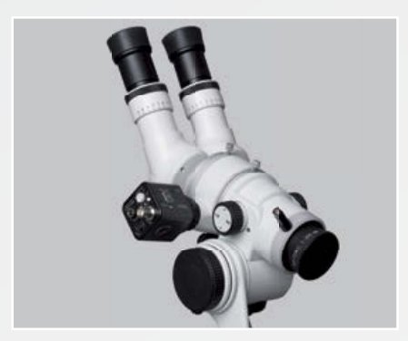
OPTIONAL VIDEO SYSTEM